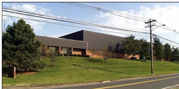
34 Barnes Industrial Road Wallingford, CT 51,260 Square Feet

For additional information please contact Rich Lee: 203.643.1006 or rlee@orldcommercial.com